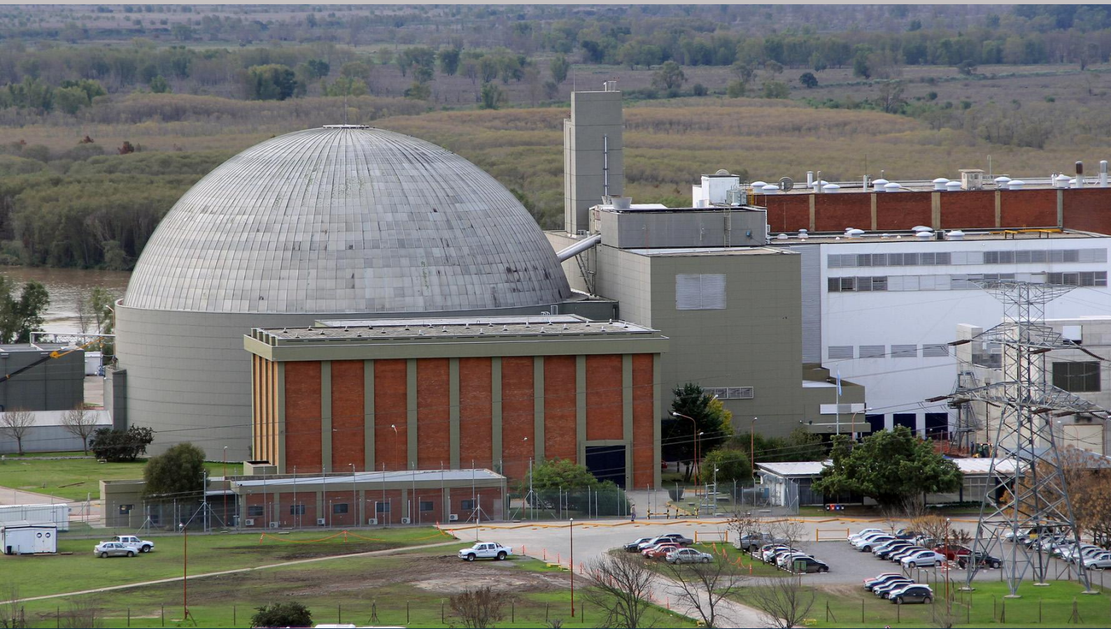
SEISMIC SAFETY EVALUATION PROGRAMME - ATUCHA I NUCLEAR POWER PLANT - LIMA, BUENOS AIRES, ARGENTINA - NUCLEOELÉCTRICA ARGENTINA SA