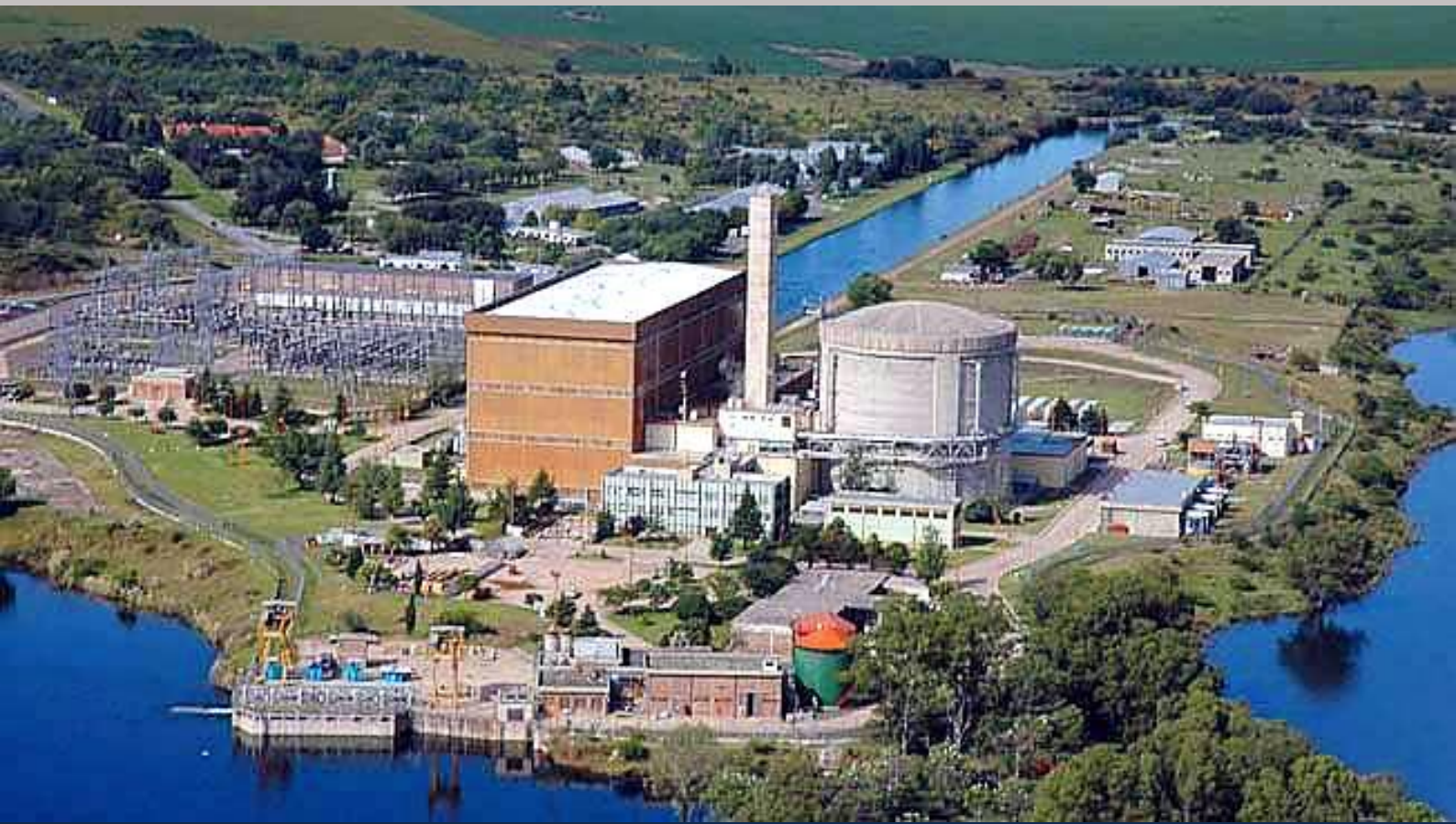
EMBALSE NUCLEAR POWER PLANT PLEX AND REPOWERING – EMBALSE, CÓRDOBA, ARGENTINA – ANSALDO NUCLEARE SPA – NA-SA