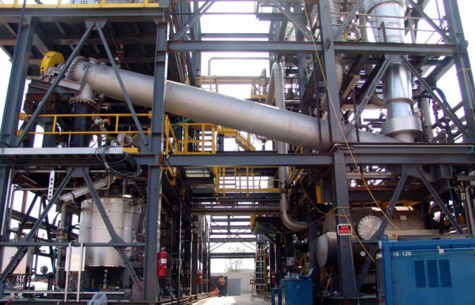
BIOOIL PRODUCTION PLANT - GUELPH - ONTARIO, CANADA – DYNAMOTIVE