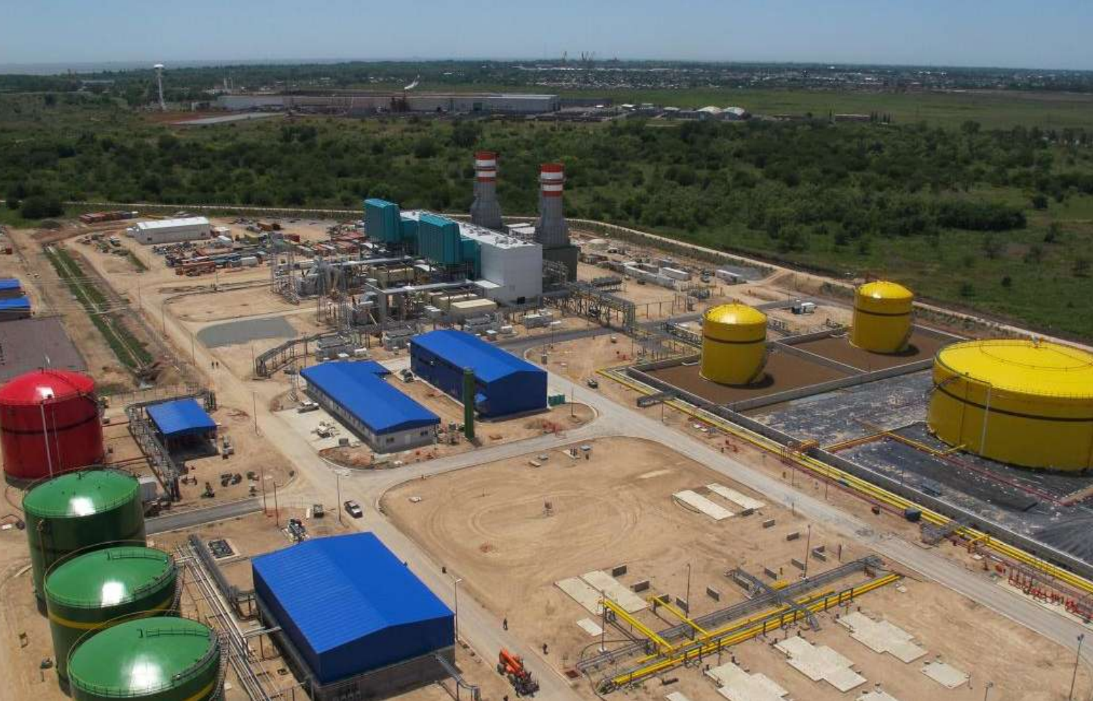
ENSENADA DE BARRAGÁN THERMOELECTRIC POWER PLANT - Ensenada, Buenos Aires, ARGENTINA – UTE ISOLUX-IECSA ENARSA