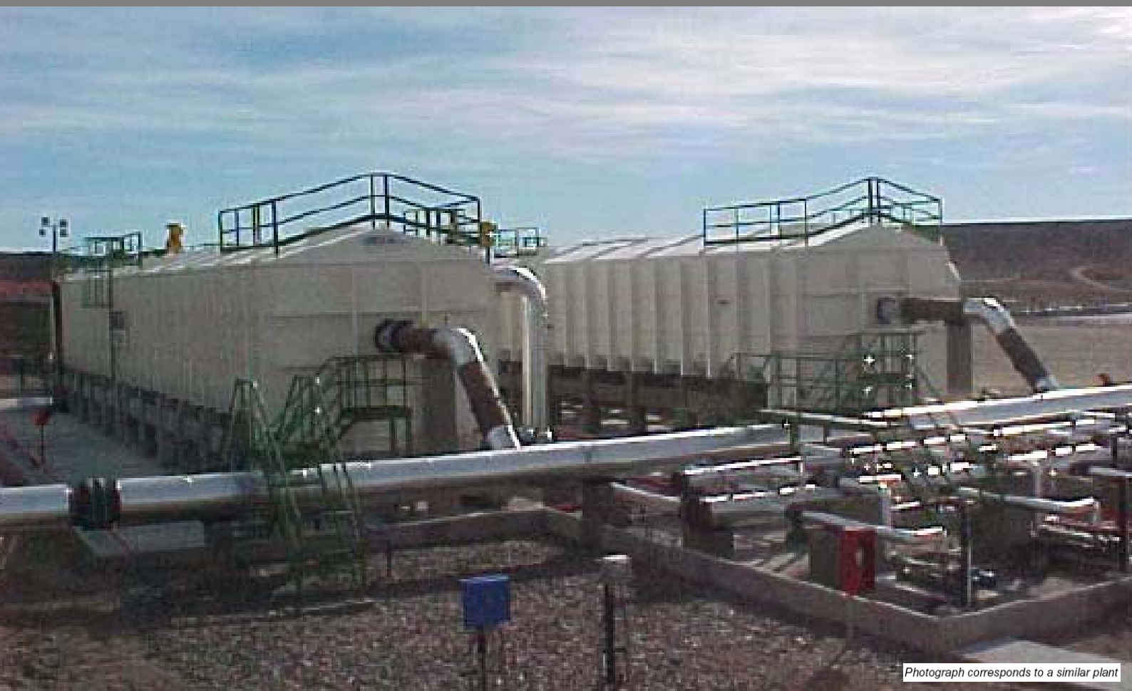
Photograph corresponds to a similar plant