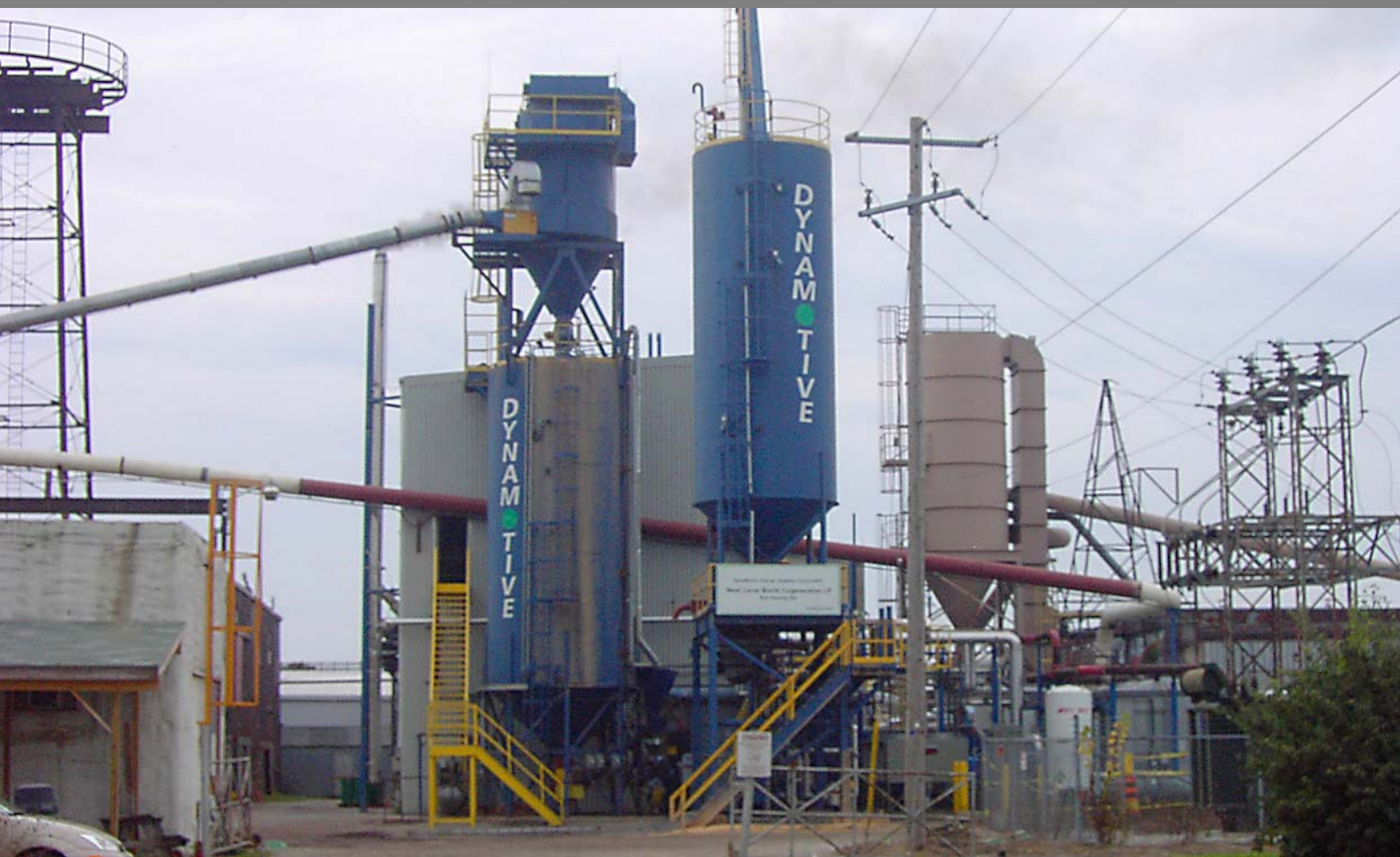
BIO OIL PRODUCTION PLANT UPGRADE - WEST LORNE - ONTARIO, CANADA – DYNAMOTIVE