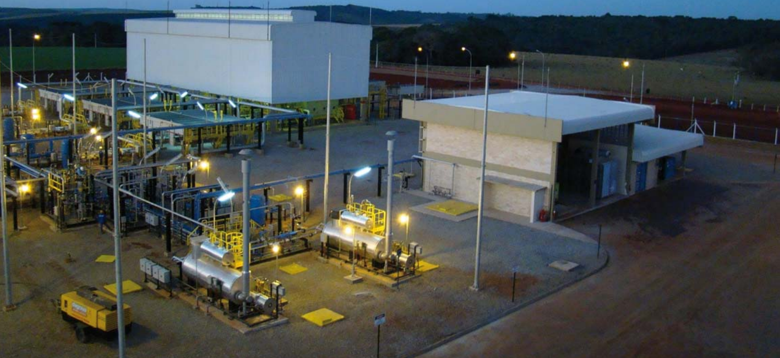
GAS COMPRESSION PLANT – CAPÃO BONITO - CAPÃO BONITO, BRAZIL – TBG (TRANSPORTADORA BRASILEIRA GASODUTO BOLIVIA-BRASIL)