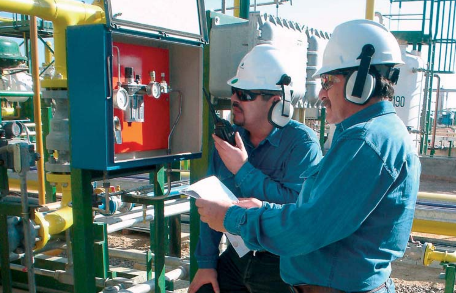
OPERATION AND MAINTENANCE - POWER GENERATION AND DISTRIBUTION - BLOCK 16, ORELLANA PROVINCE, ECUADOR – REPSOL / YPF BLOCK 16